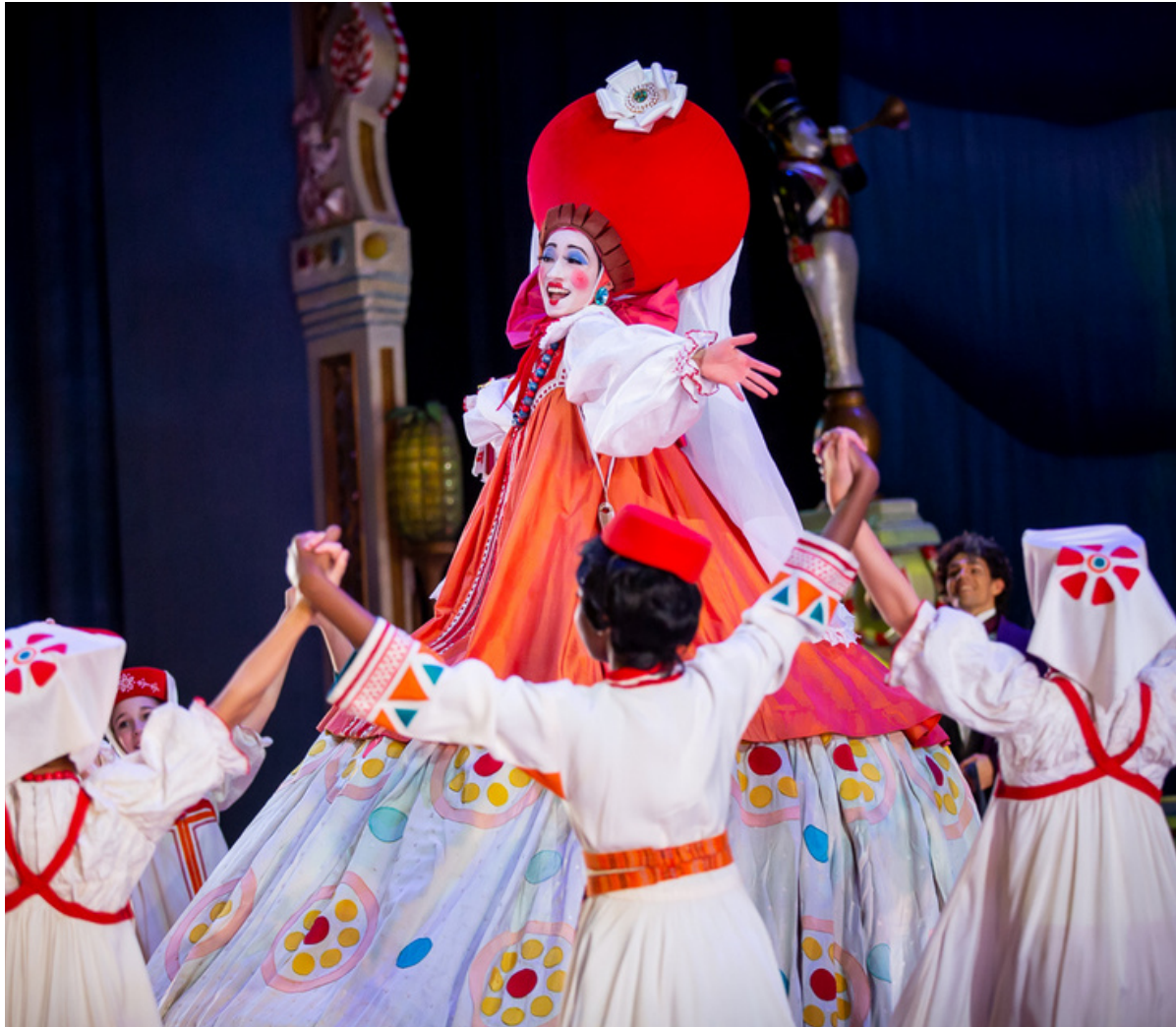
Mother Ginger

There will also be a character called Mother Ginger who is twice as tall as everyone else around her.