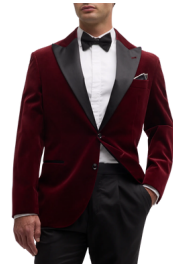
Brunello Cucinelli Neiman Marcus