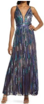
Dress The Population Nordstrom