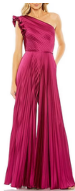
Mac Duggal Dillard's