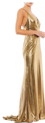
Mac Duggal Saks Fifth Avenue